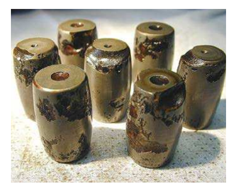
Rollers from a counterfeit spherical roller bearing

If installed in safety critical equipment, counterfeit products may present a great safety risk for people and/or the environment.